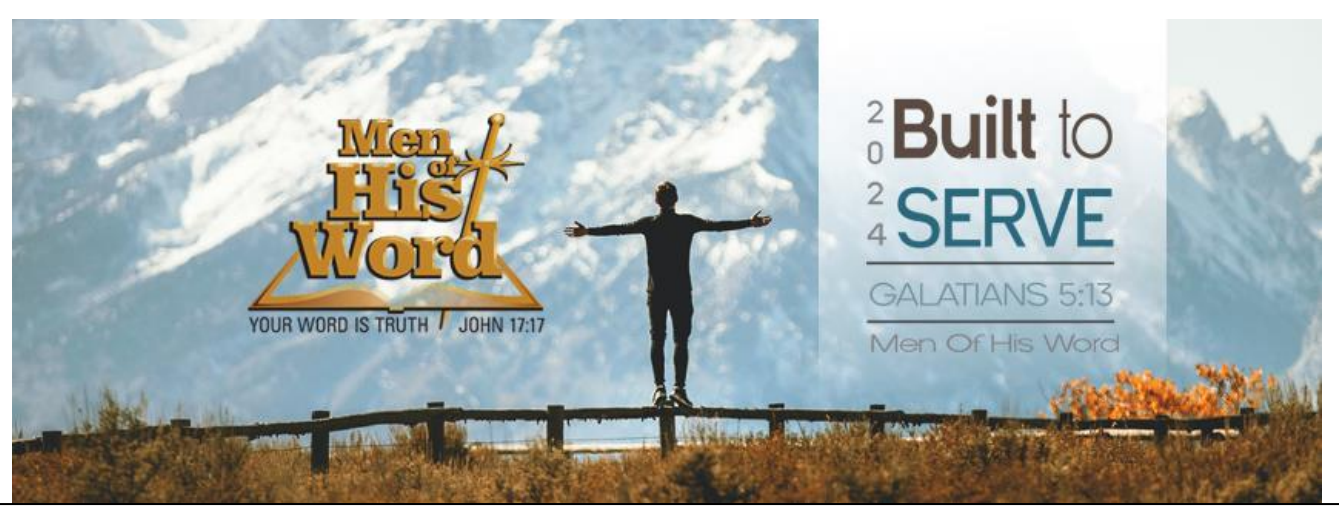
2024 Men of His Word Conference – Built to Serve